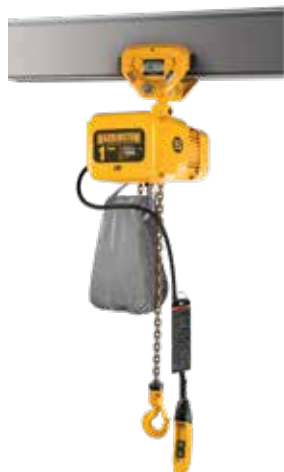
NERP/ERP010S (Shown with optional canvas chain container and rubber bumpers)

Mounting our NER/ER Series hoists to either a PT push or GT geared trolley will create an easy and economical method of transporting the load. This combination is ideal for small workshops and infrequent moves.