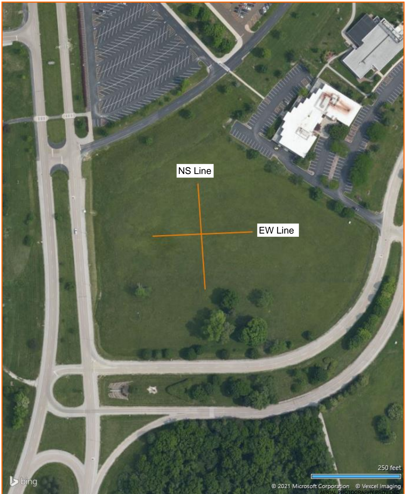
DIAGRAM IS FOR GENERAL LOCATION ONLY, AND IS NOT INTENDED FOR CONSTRUCTION PURPOSES

SIUE Health Sciences Building ■ Edwardsville, IL November 5, 2021 ■ Terracon Project No. 15215038