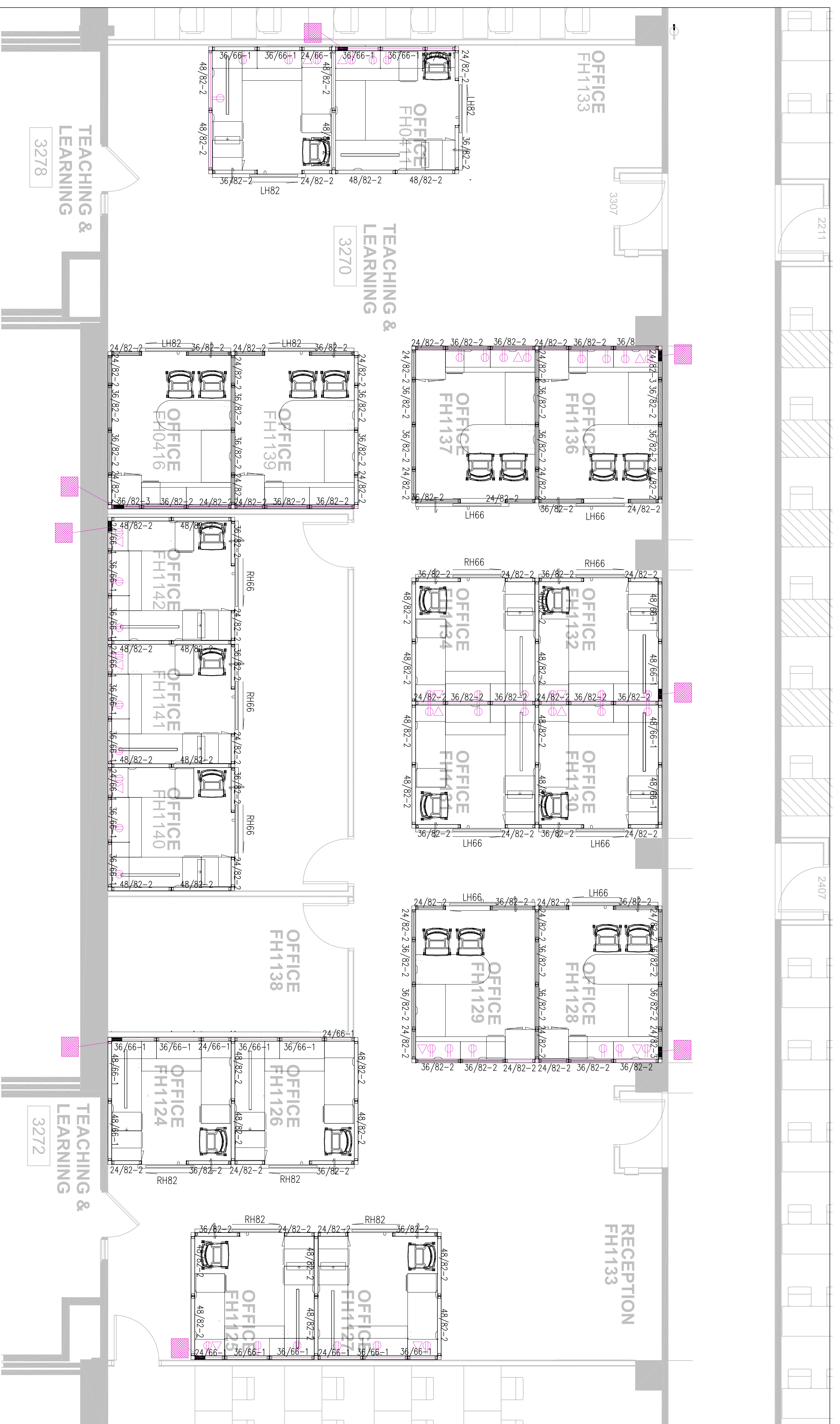
1 FURNITURE PLAN – THIRD FLOOR – PHASE 2 F-2 SCALE: 1/4" = 1'-0"