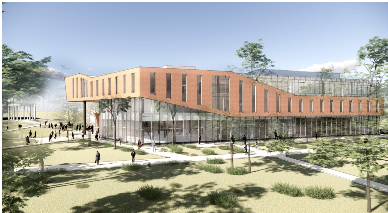
UIS Library Commons Springfield, Illinois 830-080-018