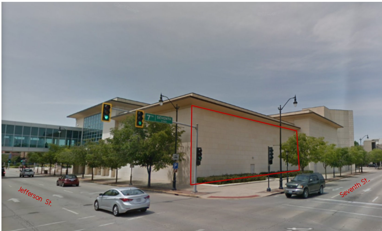
Artwork area facing Seventh Street.