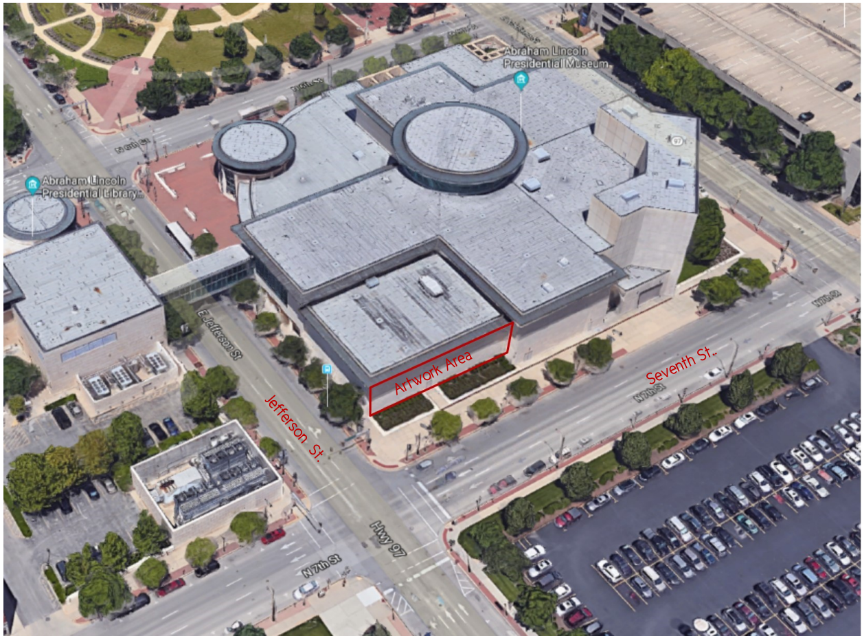
Artwork area on Seventh St. looking northwest.