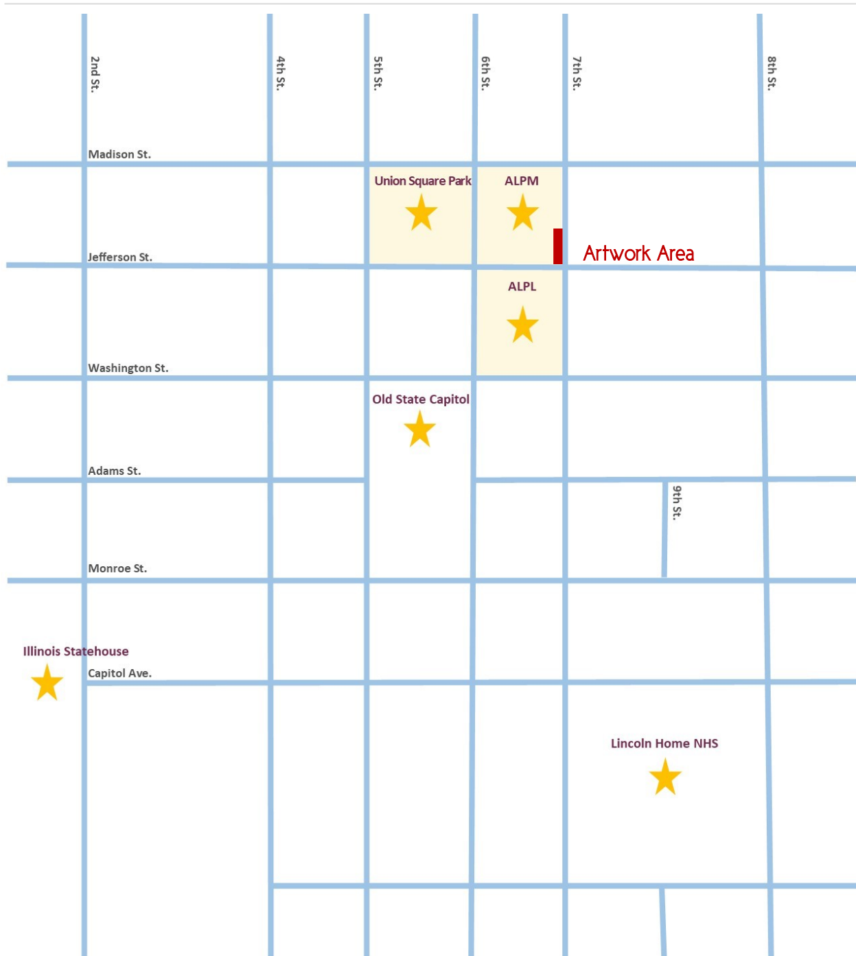
Downtown Springfield, Illinois