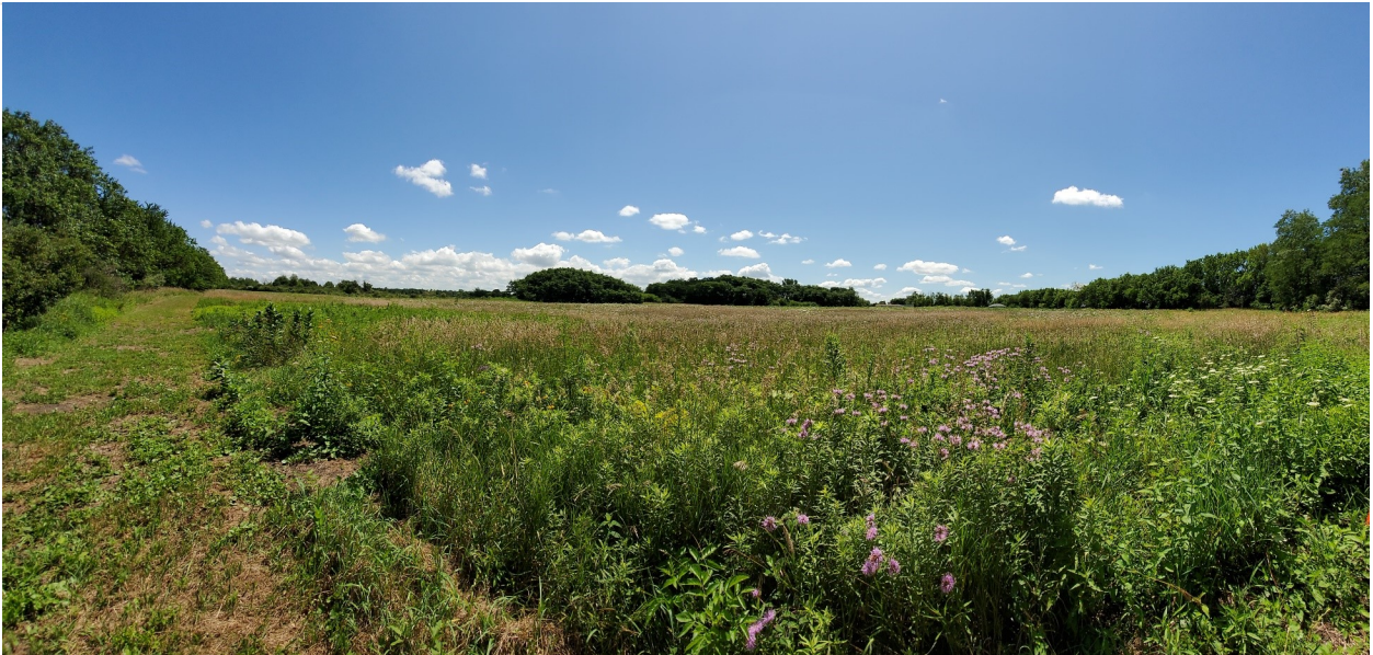
View from the artwork area to the east. Path on the left leads to Bodark Arc along the north edge of the Butterfly Ranch.