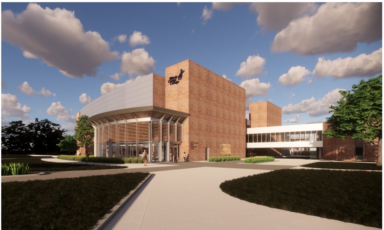
ICC Library and Administration Building East Peoria, Illinois 810-036-026