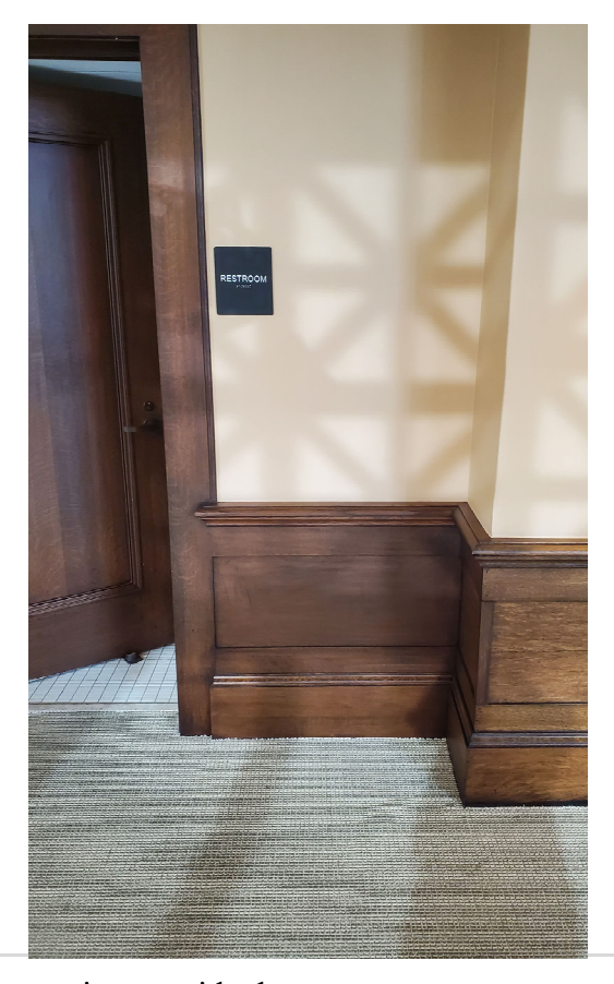
These images show one of the artwork sites, two alcoves just outside the restroom