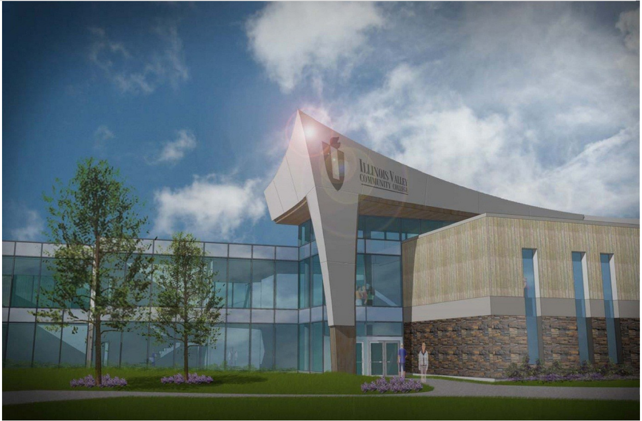
IVCC Peter Miller Community Technology Center rendering