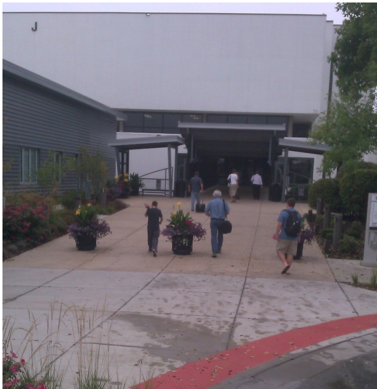
Location for Artwork looking south toward J Building