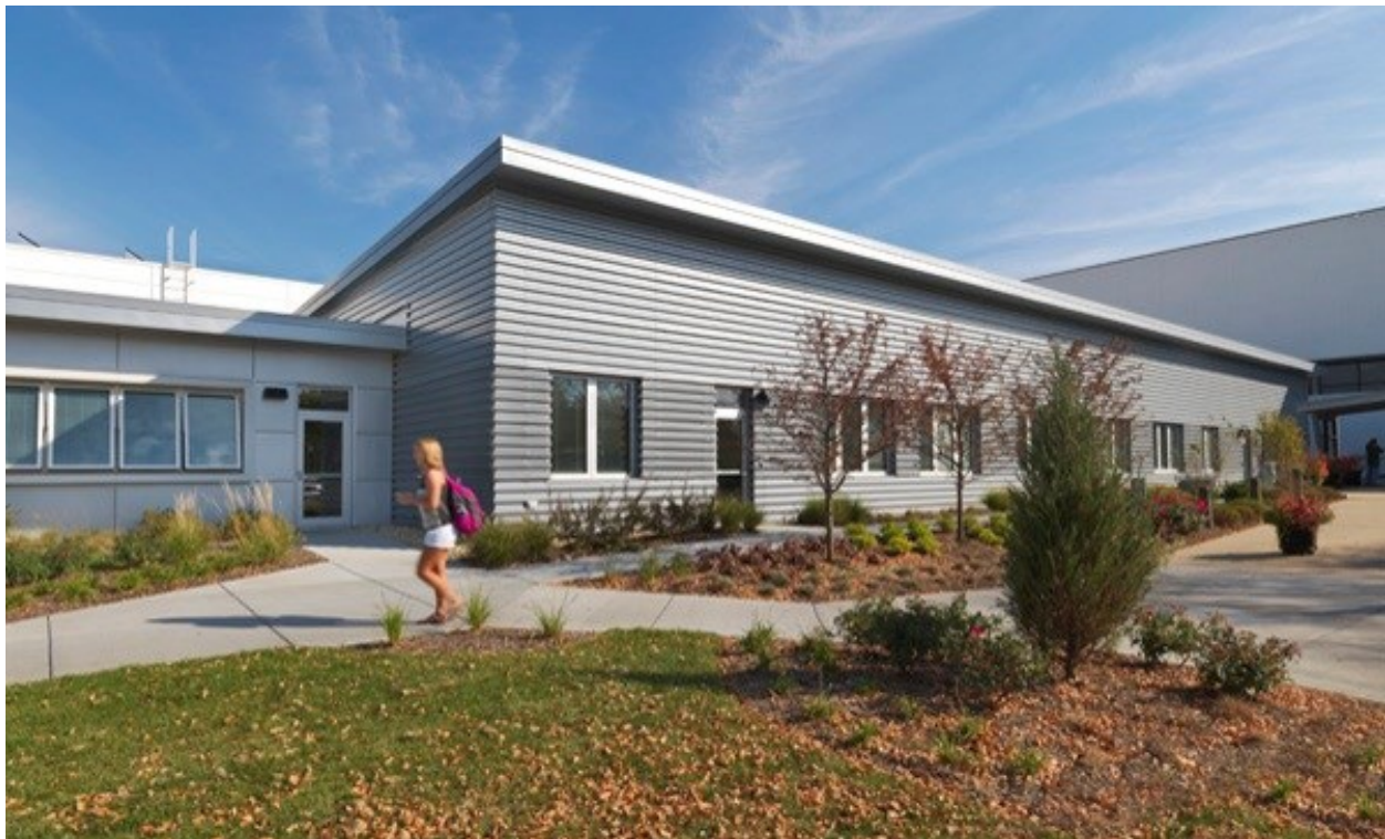
West side of Facilities Services Building—approaching location for artwork