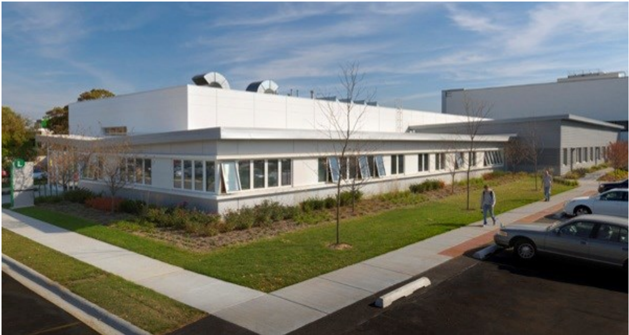
Northwest corner of Facilities Services Building