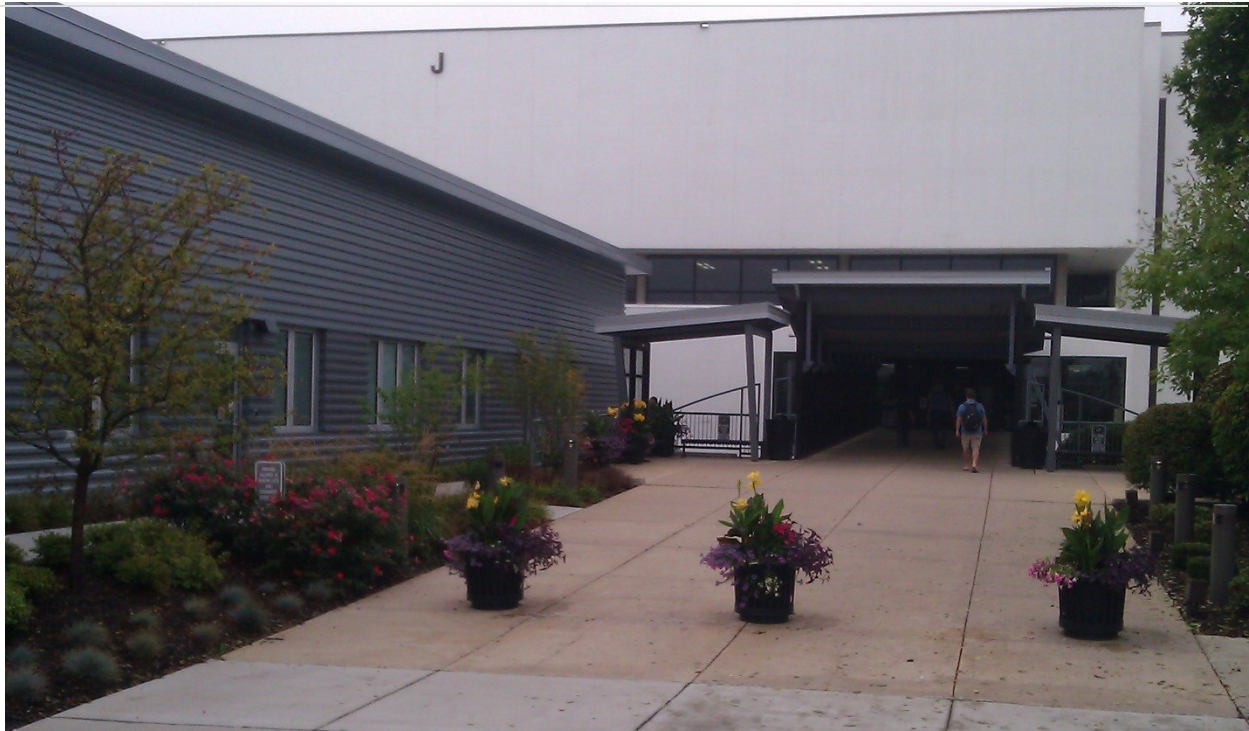
Location for Artwork—looking south toward J Building