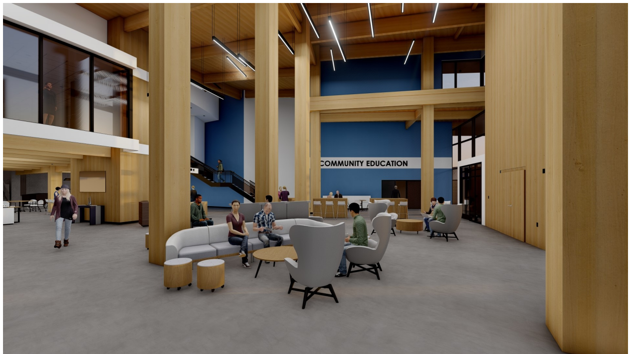
John A. Logan College Carterville, Illinois 810-064-022