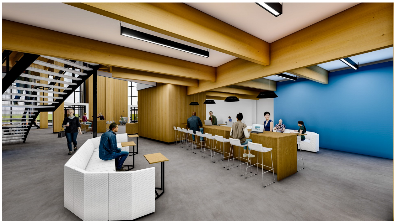
John A. Logan College Carterville, Illinois 810-064-022