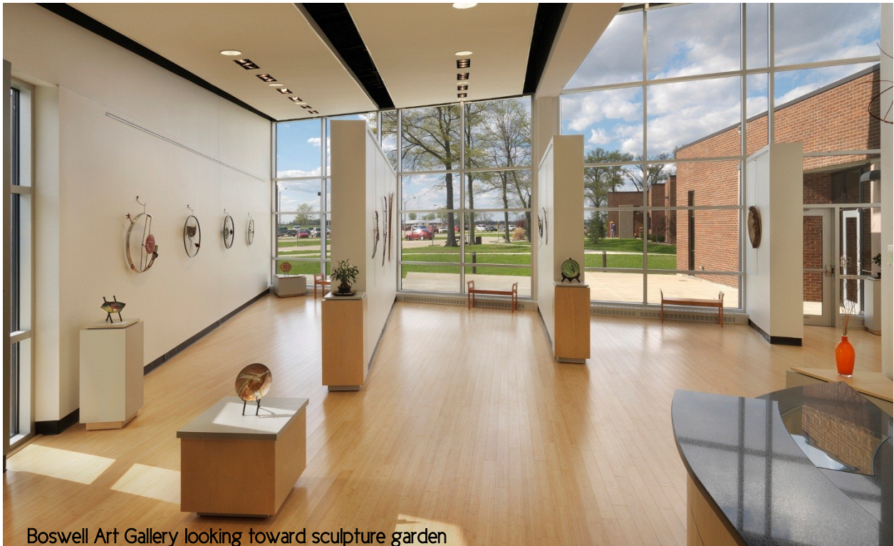
Boswell Art Gallery looking toward sculpture garden