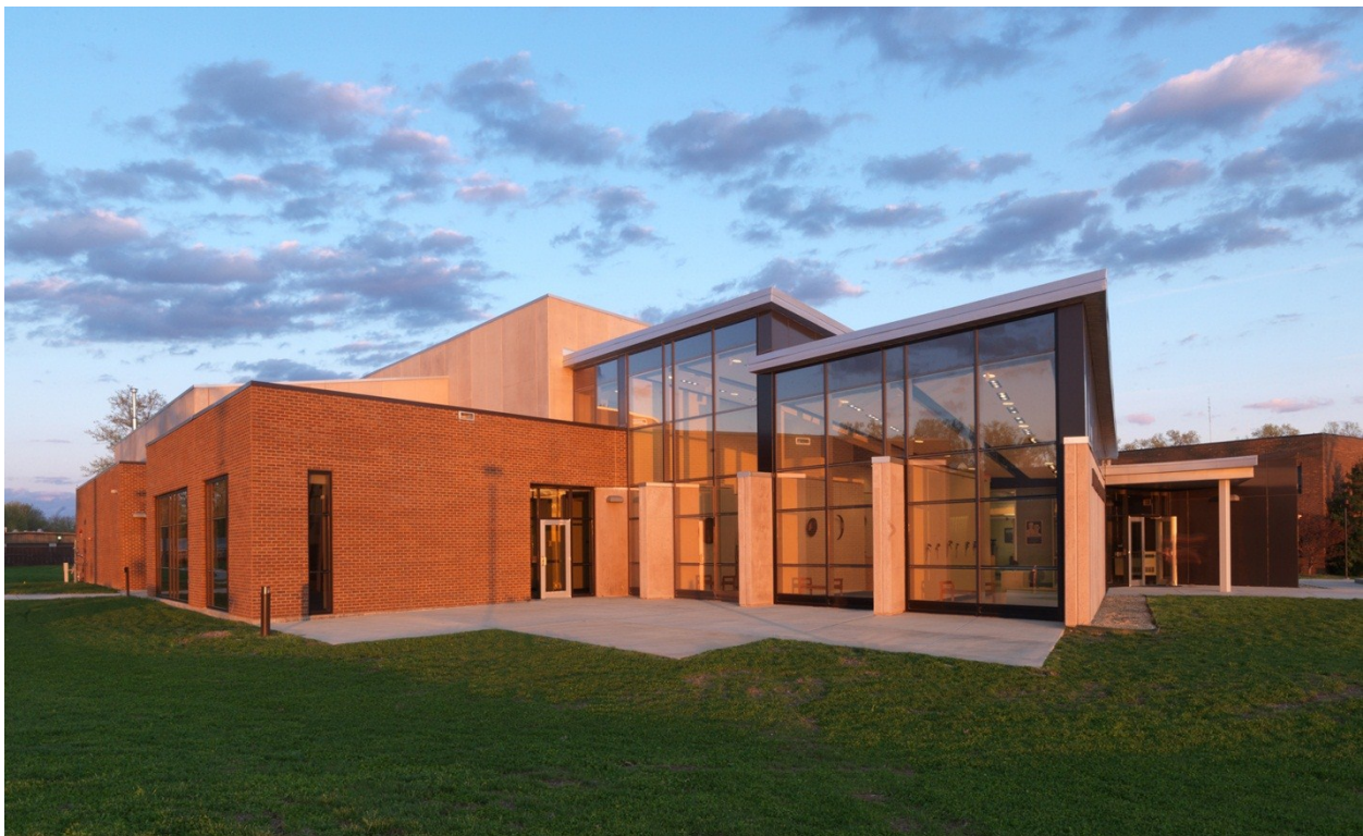
Exterior Lifelong Learning Center, sculpture garden, Boswell Art Gallery