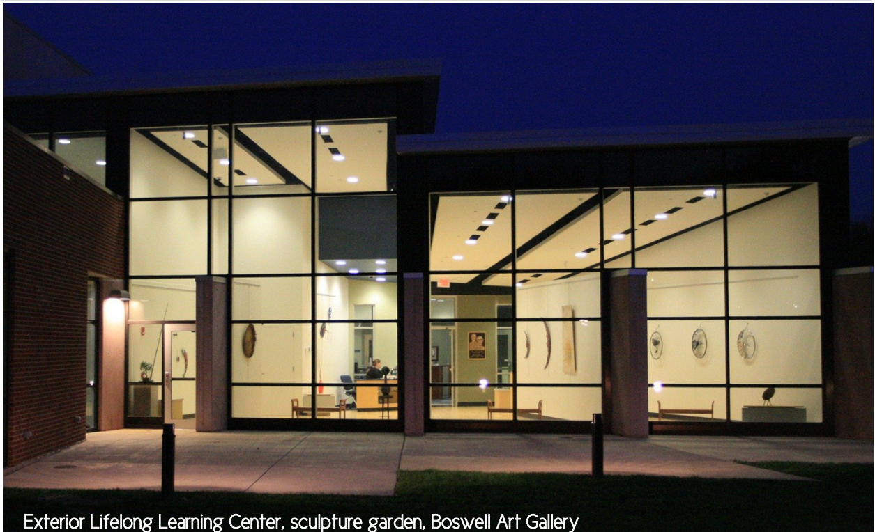
Exterior Lifelong Learning Center, sculpture garden, Boswell Art Gallery