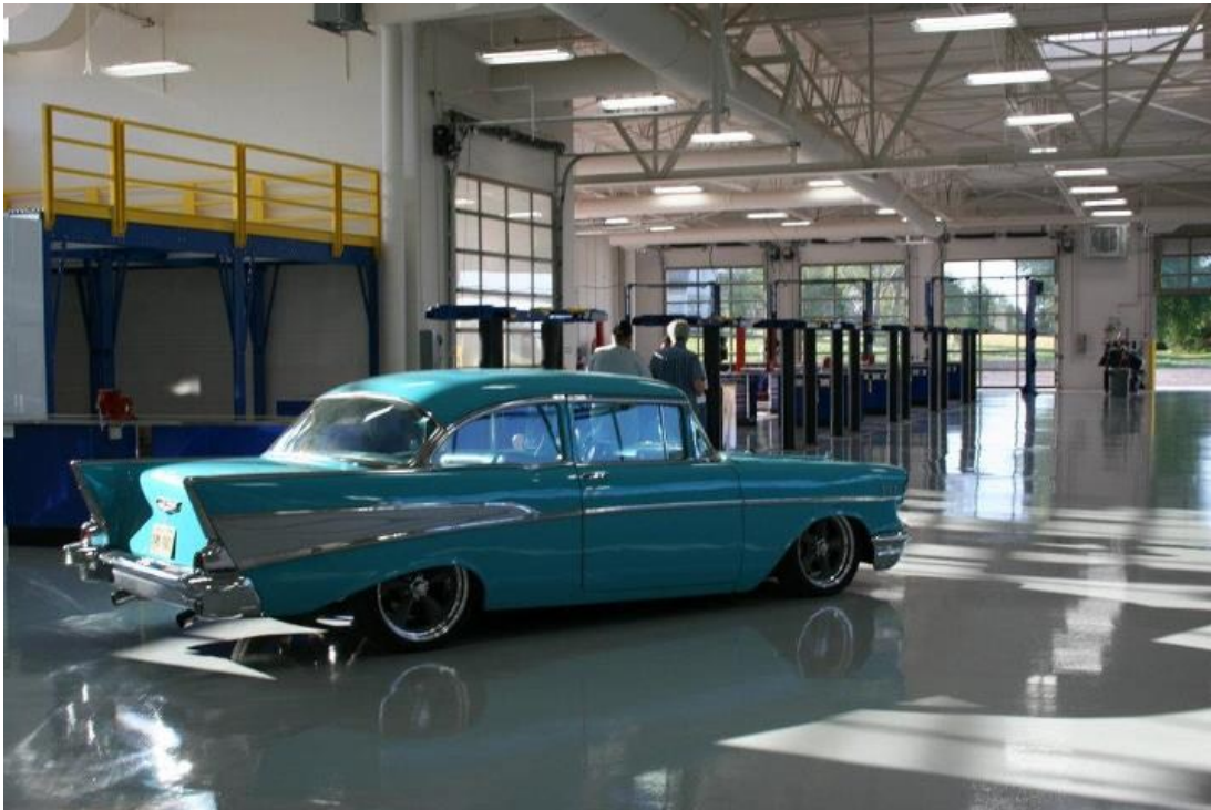
Parkland College Applied Technology Center Champaign, Illinois 810-074-018