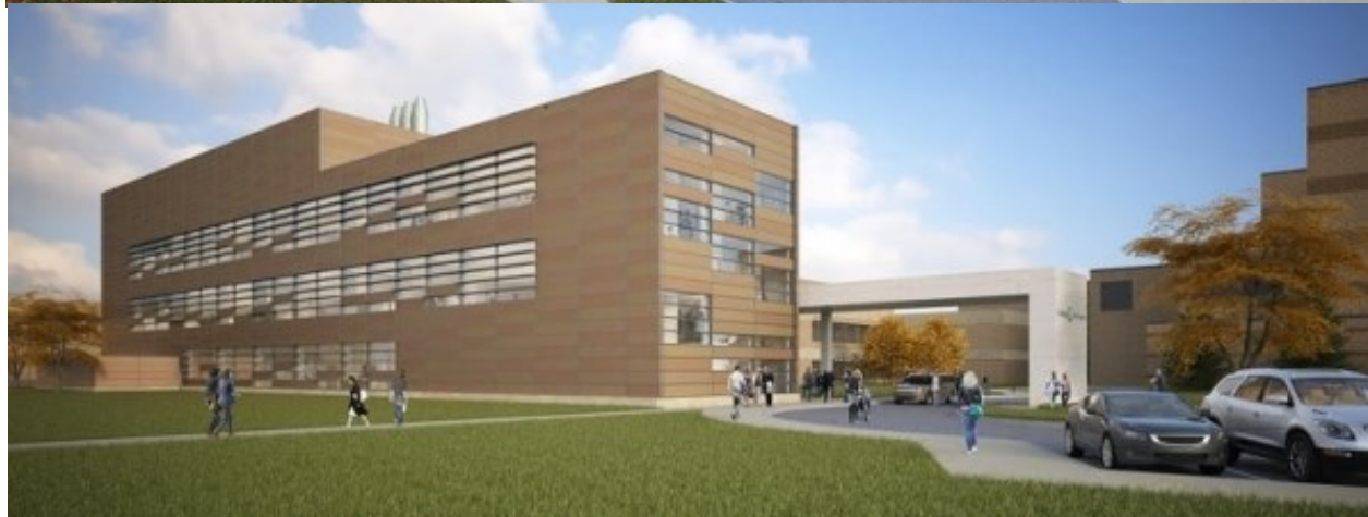
College of Lake County Science and Engineering Building Grayslake, Illinois 810-056-025