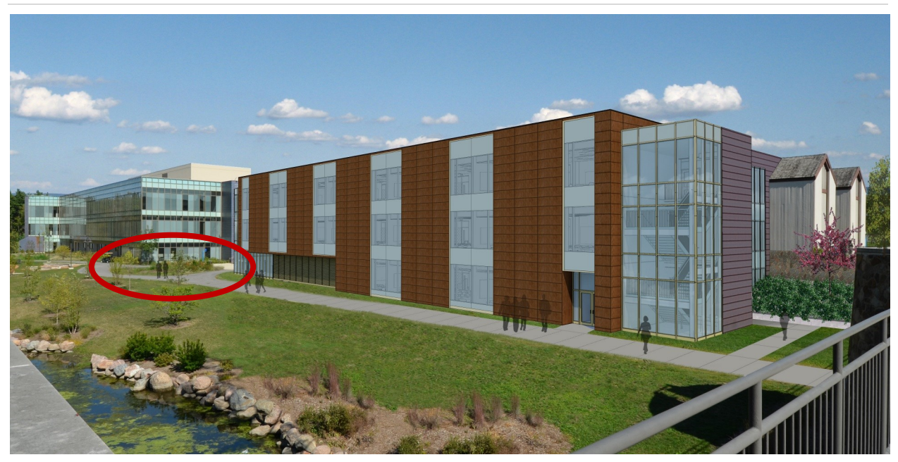
Rendering of Classroom Building 1 showing artwork area