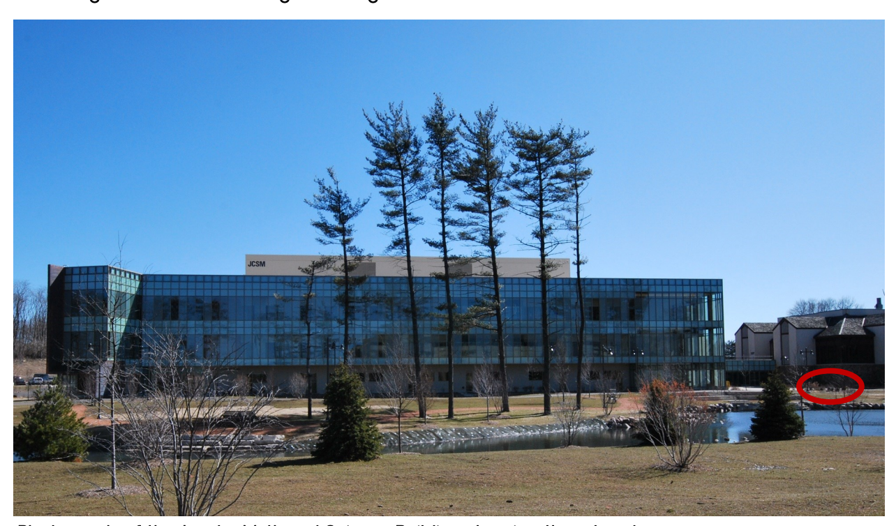
Photograph of the Jacobs Math and Science Building showing the artwork area