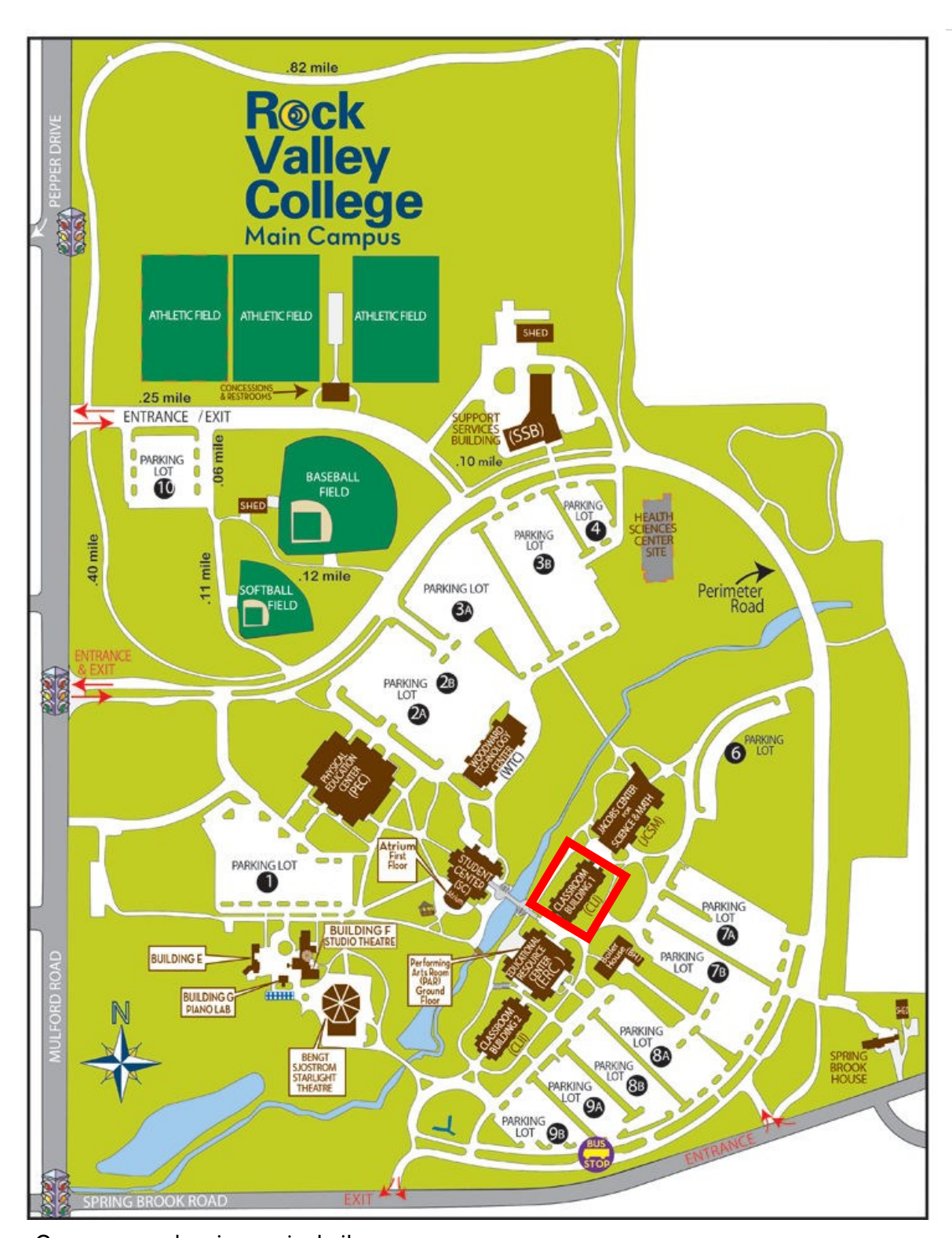
Campus map showing project site