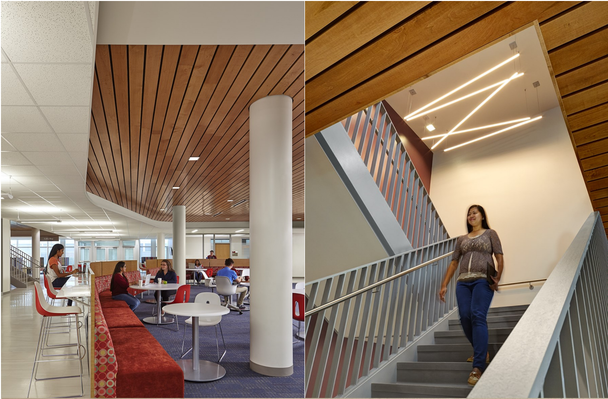
Commons and Commons Stairwell