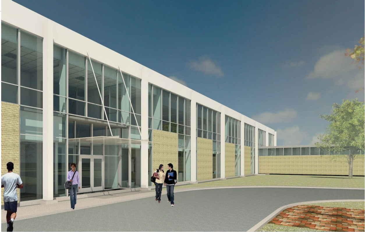
Health and Science Building entrance