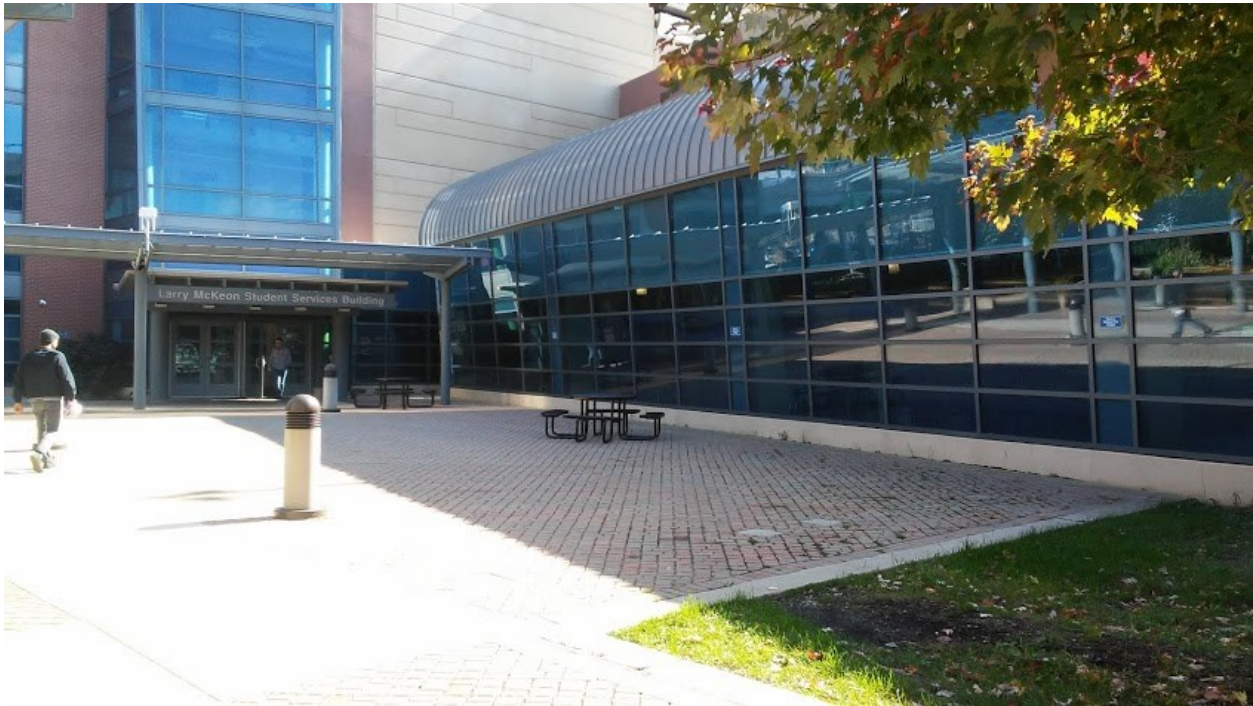
Brick courtyard artwork area