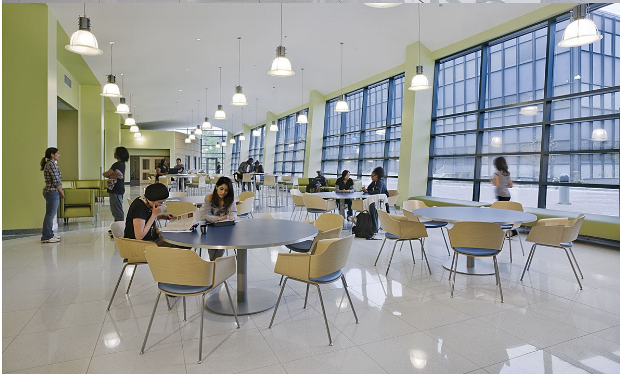
Interior looking out toward brick courtyard artwork area