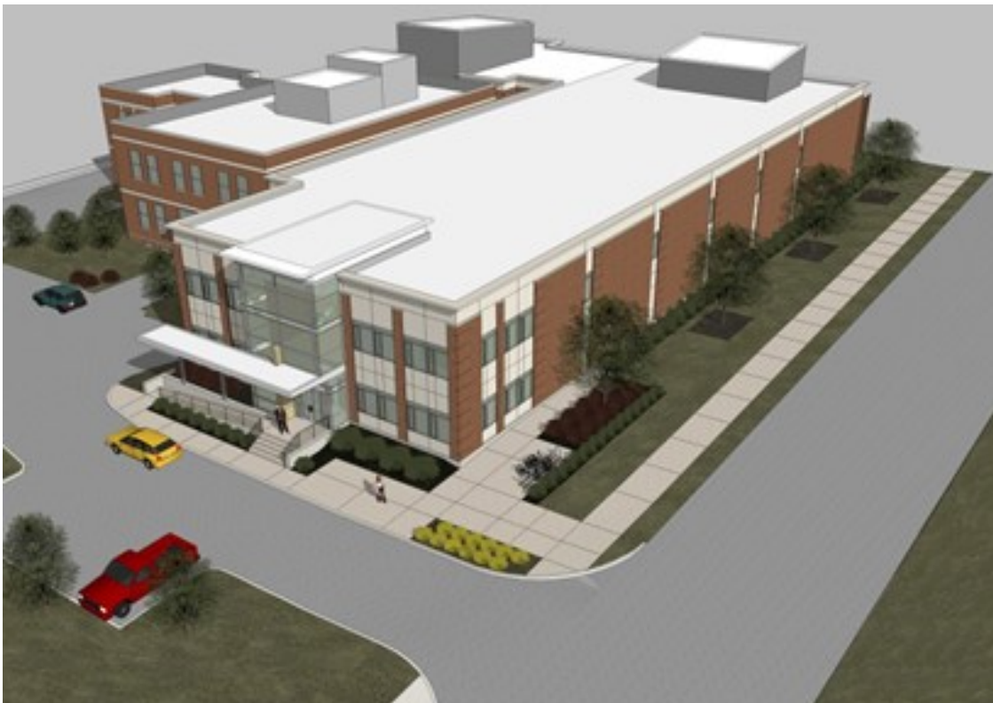
UIUC Integrated Bioprocessing Research Lab Urbana, Illinois 830-010-332

The 35,000-sq-ft Integrated Bioprocess Research Laboratory will house some 25 faculty, student, and industrial researchers that represent multiple disciplines. A pedestrian bridge will connect the new facility with the existing Agriculture Bioprocess Lab. The facility is planned to be LEED Silver certified.