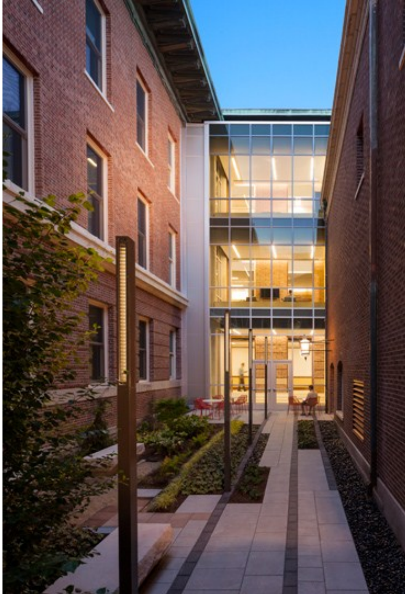
Lincoln Hall Courtyard