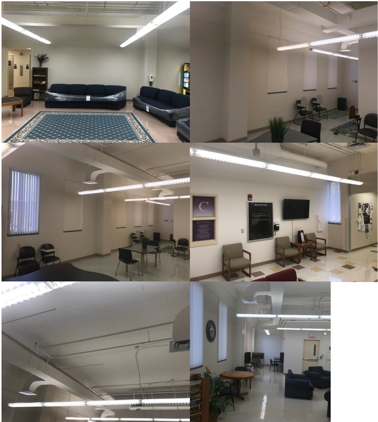
Examples of interior spaces